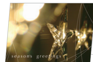
A616 (148 x 105mm)