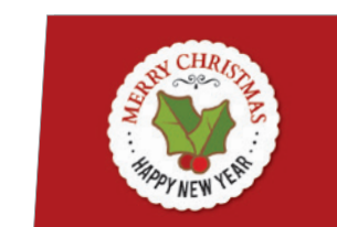
A626 (148 x 105mm)