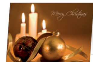
A621 (148 x 105mm)