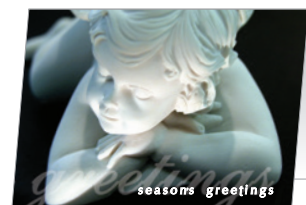
A620 (148 x 105mm)