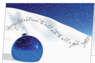
A628 (148 x 105mm)