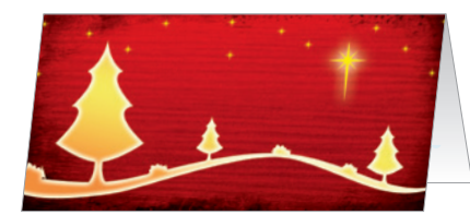
DL08 (99 x 210mm)