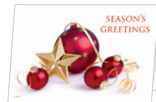
A631 (148 x 105mm)