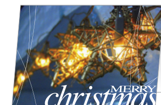
A619 (148 x 105mm)