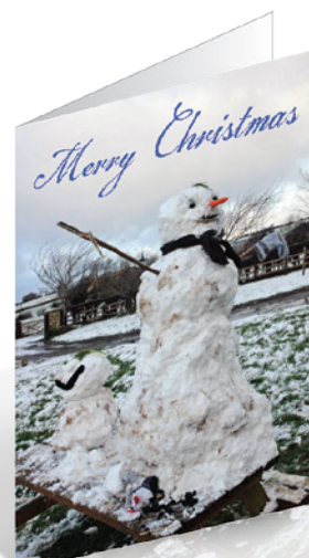
A634 (148 x105mm)