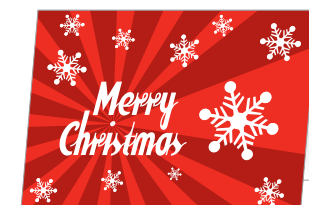
A617 (148 x 105mm)