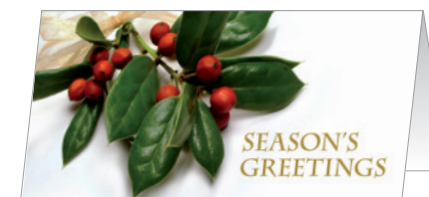
DL07 (99 x 210mm)