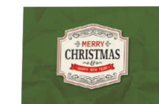
A627 (148 x 105mm)