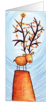
DL04 (99 x 210mm)