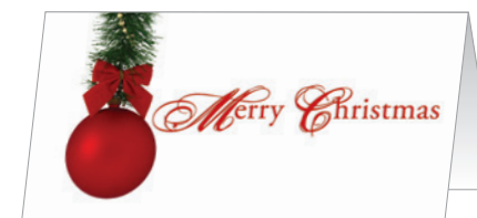
DL06 (99 x 210mm)