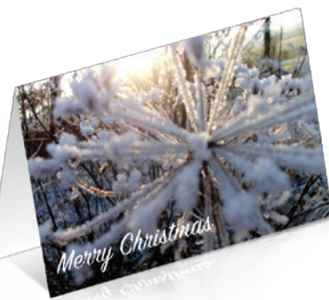
A633 (148 x105mm)