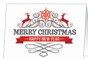
A624 (148 x 105mm)