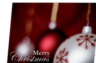
A623 (148 x 105mm)