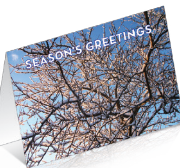
A635 (148 x105mm)