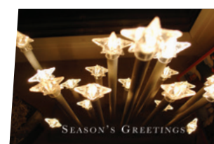
A622 (148 x 105mm)