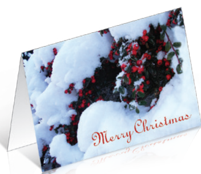
A632 (148 x105mm)