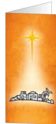
DL02 (99 x 210mm)