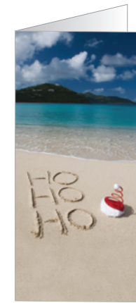
DL03 (99 x 210mm)