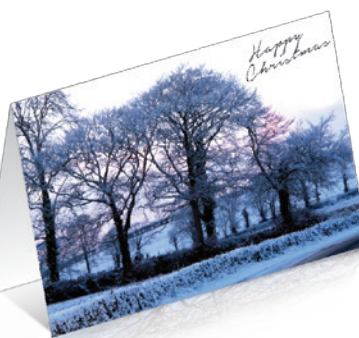
A636 (148 x105mm)