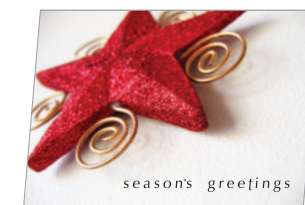
A618 (148 x 105mm)