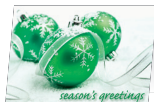
A629 (148 x 105mm)