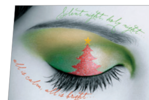
A630 (148 x 105mm)