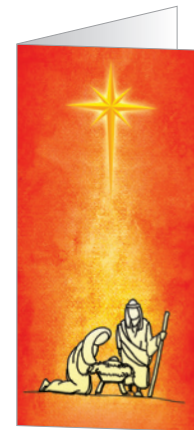
DL01 (99 x 210mm)

Orderform overleaf or visit www.thecormactrust.com/christmascards