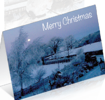
A637 (148 x105mm)